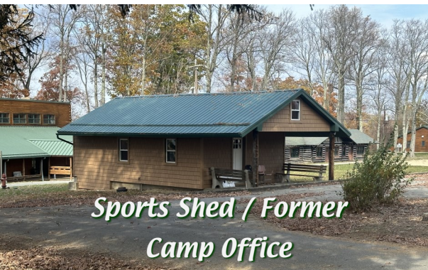
Sports Shed / Former Camp Office

As always, we will be continuing to improve our facilities in order to better host our future programs. Thank you again for your incredible support!