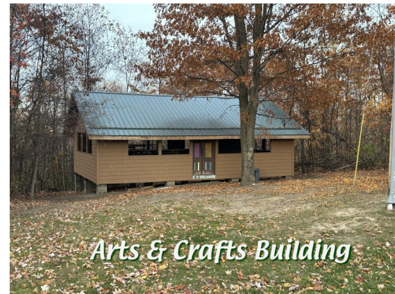
Arts & Crafts Building