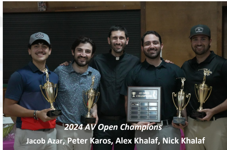
2024 AV Open Champions