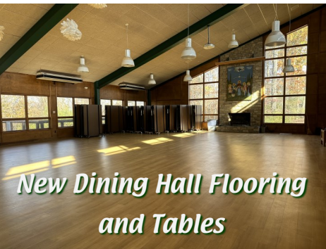
New Dining Hall Flooring and Tables